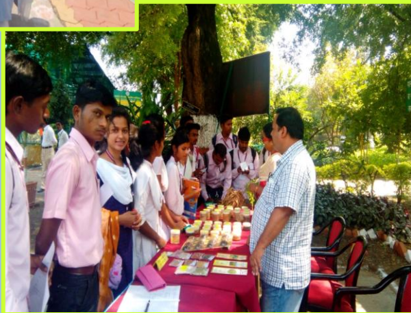
Visit to SHIVAR PHERI-2017