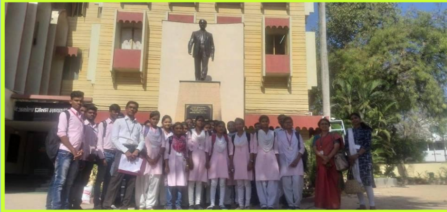
Department Visit to Akola District Central Co-operative Bank, Akola Dt.5 March 2019